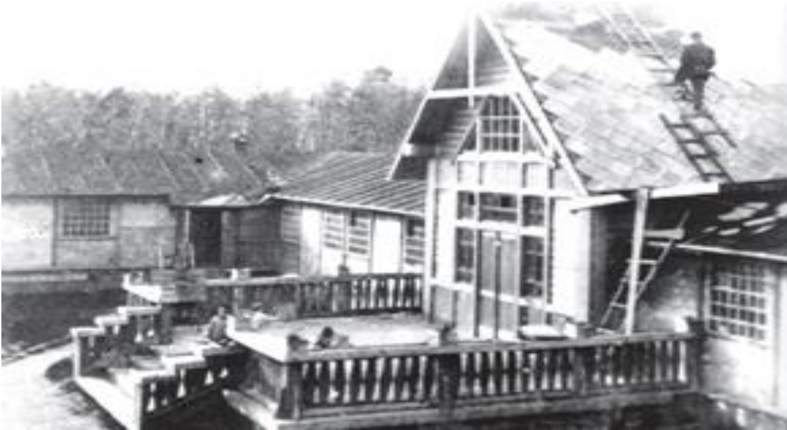
Fig. 3. Buildings of the colony “The Invigorating Life” (1911)

“The Invigorating Life” was a self-sustainable institution. There were built the following facilities in the territory of the colony: Shatskii’s house (there were also an administrative office and a music room in Shatskii’s house), a school building, a cook-house and a summer canteen house, a club-canteen building, a cellar, a power station, workshops, a dormitory, a dormitory for teachers, a club, a stadium, a radio antenna, a cattle yard, a vegetable garden, a fruit garden.