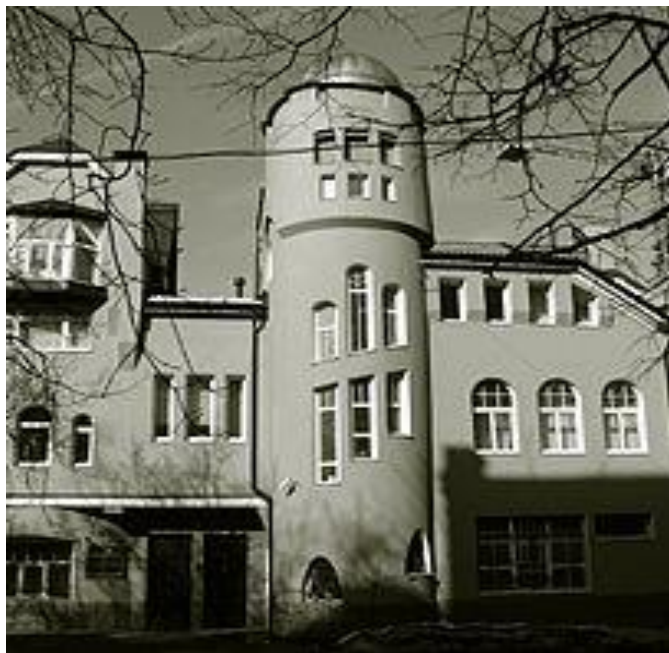
Fig. 2. Building of the society "Children's work and rest"