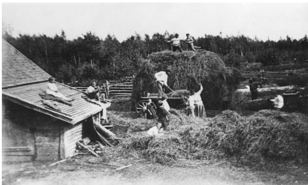
Fig. 4. Hay harvest in the colony (1925)

But labor should not be punishment or some chore. In that case, it will only have a negative effect. Shatskii claimed that labor must be systematic, replaceable and according to children's possibilities. Work must bring children positive emotions and real joy. Labor activities of pupils should be under the close attention of teachers who skillfully and tactfully direct, support and encourage them. The purpose of labor, according to Shatskii, is not only to master basic household skills, labor – is, above all, a tool that organizes a children's team on the principles of creativity, friendship and mutual assistance.